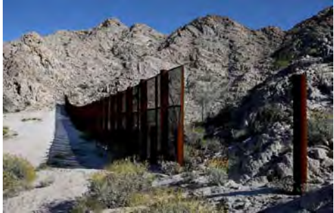
Photo 3: Fencing in Barry Goldwater Range

Finally, in the Barry M. Goldwater Air Force Range, a military bombing and gunnery range, the United States has constructed "PF70" fencing along approximately 50 kilometers of the Range's roughly 65-kilometer border with El Pinacate. See Ex. B. PF70 fencing is a relatively high wall, preventing passage of both pedestrians and wildlife. See Photo 3; Ex. B.